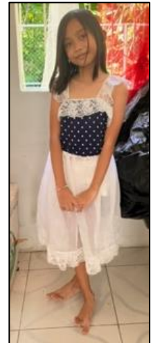
Sky, the new seamstress and her new dress.