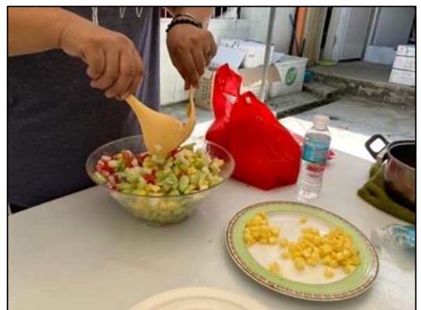
From left: Dana and The Pig. (lechon), seaweed salad, vegetable salad, fish and vegetable soup.