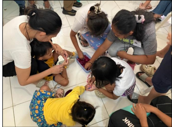
Stringing beads for necklaces on Children's Day.