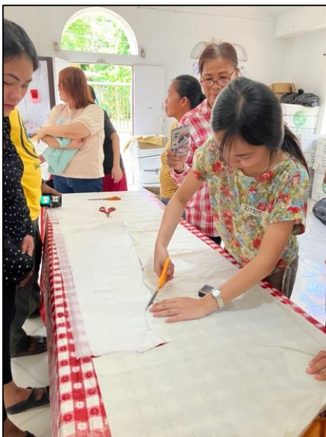
Left. Each step of the sewing process was taught deliberately and coached so they could repeat it after we were gone. The women quickly learned and helped each other as needed. Right. The sewing room. Crowded, but happy.

VIMI shipped eight sewing machines*, lots of fabric, all the necessary notions and tools, and some patterns. Many women learned to sew and now have access to the sewing machines that might earn them income. They were thrilled with their projects and we enjoyed a fashion show on our last day. *Thank you Midwest Mission for helping with that.